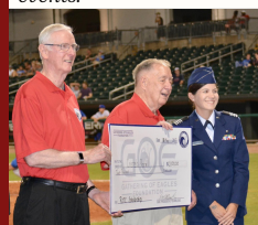
Below: Academic Year(s) 2020-21 Eagles and Eaglets participating in various Capstone events.